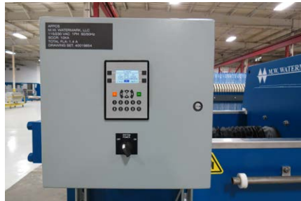
M.W. Watermark Filter Press with AFPCS