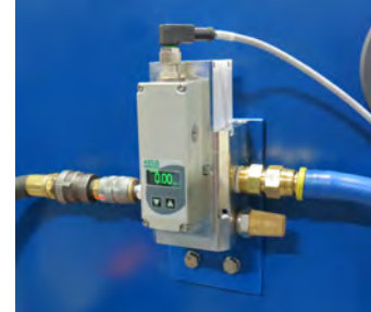
AFPCS Pump Control Mounted to Filter Press