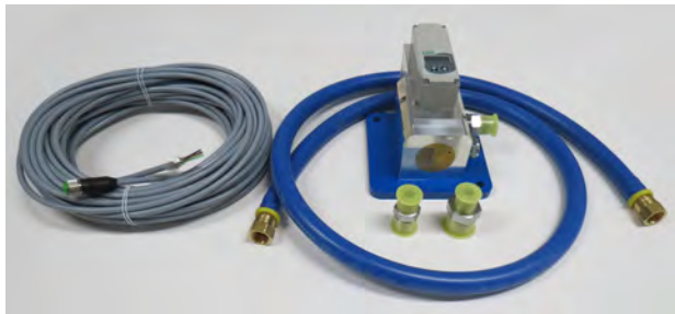
AFPCS Pump Control Kit - Part Number: 40031272